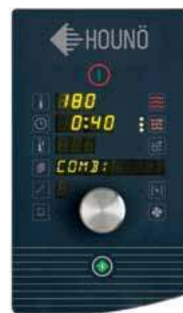
K standard model