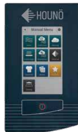
KPE touch model