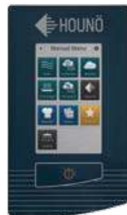
CPE touch model