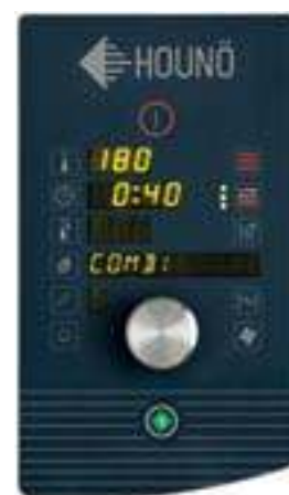
C standard model