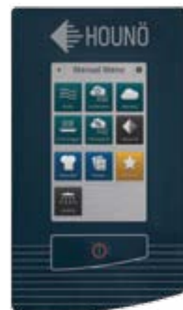
KPE touch model