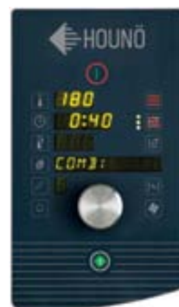
K standard model